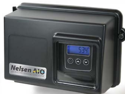
AIO System featuring the Pentair Fleck 2510AIO SXT Control Valve Shown with Optional Tank Jacket