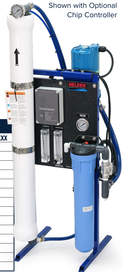
NRO-S-1440F-2500-1-CXX Shown with Optional Chip Controller