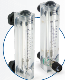
Permeate & Concentrate Flow Meters