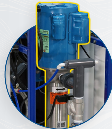
Multi-Stage Booster Pumps

The optional and economical CHIP Controller removes the need for a low pressure switch to control the pump and a start delay to prevent system cycling. A switching power supply operates on 96-264VAC, automatically adjusting to operating voltage. Voltage at the supply terminals is the voltage for the pump and valves. The controller allows for tank level, system flushing (not available on SIMPLX systems, pre-treatment lockout, & start-up delays.