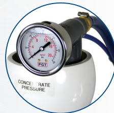
Concentrate Pressure Gauge