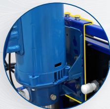
Easy Motor Mount Bracket