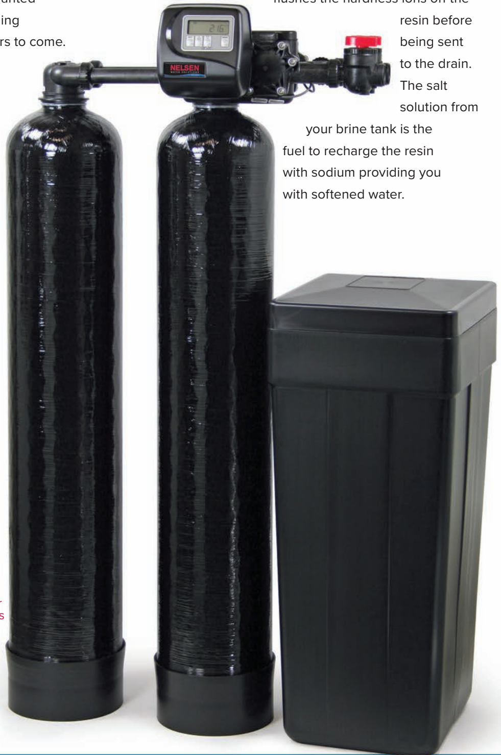
C-Series Twin Softener Shown with Optional Bypass

your brine tank is the fuel to recharge the resin with sodium providing you with softened water.